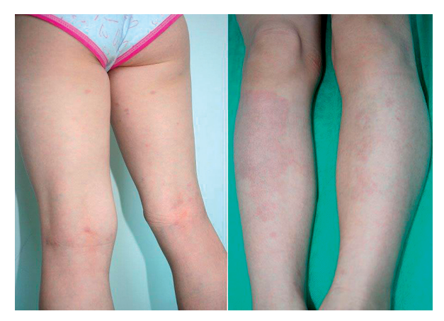
Figure 1. Erythematous, indurated, sharply demarcated plaque on the right shank and single nodules on the thighs

erythematous [6], rheumatoid arthritis [7], autoimmune thyroiditis [4], autoimmune hepatitis [8] and primary antiphospholipid syndrome [9]. Because of common coexistence of IGD and rheumatoid arthritis, a distinct entity – interstitial granulomatous dermatitis with arthritis (IGDA) has been distinguished [7]. In the reported case, due to an increased titer of antinuclear antibodies and possible connection to an underlying autoimmune disorder, the